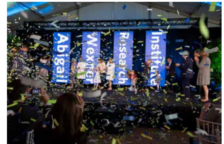
More than 350 guest and leaders, including the Governor and First Lady, came together to celebrate the dedication of the Abigail Wexner Research Institute.