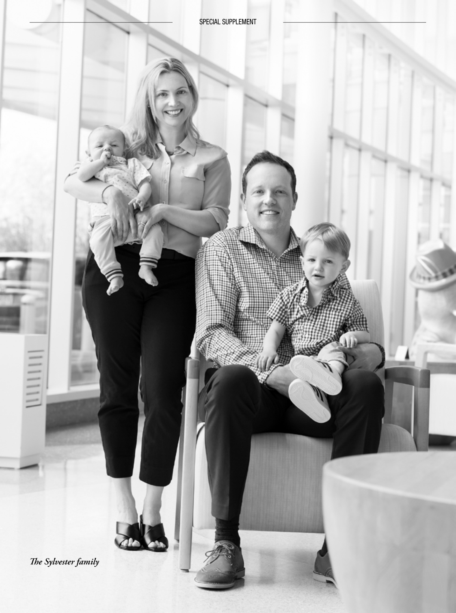
The Sylvester family