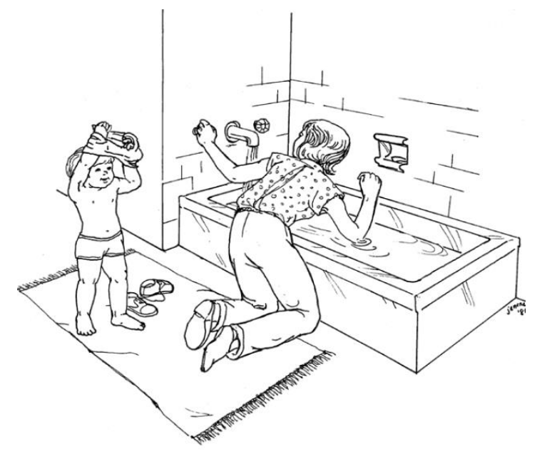
Picture 3 Never leave your child alone in the tub – even for a second.

• Never leave your child alone in the bathtub, hot tub or backyard pool - even for a second. If you must leave for any reason, take your child with you. Young children can drown very quickly in a small amount of water. When giving baby a bath, use a plastic dish pan or infant tub with a non-skid mat to keep your baby from slipping. Always test the water with your elbow first to avoid burning the baby's delicate skin (Picture 3). See Helping Hand Bathing Your Baby, HH-IV-2.